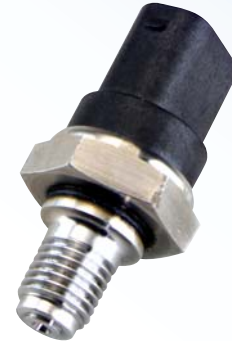
Fig. 2: Kavlico P5000 Pressure Sensor

To find out more about Kavlico sensors for Hydraulic applications check out the Kavlico website at: Hydraulics .