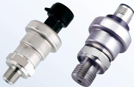
Fig. 1: Kavlico P4000 and P250 Pressure Sensors

There are few practical alternatives to hydraulics. Mechanical systems could be designed with motors and gears but those systems would have to be sized for the maximum load and would be large and inefficient. Pneumatics or air pressure could be used in some applications but air compresses and any leak would immediately deflate the system. The air compressor size and power requirements would be significantly larger and more complex than the hydraulic system. While hydraulic systems do spring leaks, it takes time to drain all the fluid out of a system through a leak and it can be detected and repaired before damage is done to the operator or system.